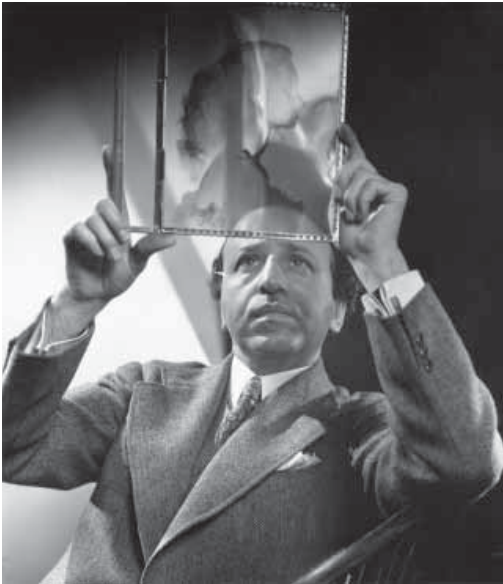
Yousuf Karsh (1908–2002) Self-portrait (with Ford of Canada series) not dated gelatin silver print Collection of Ford Motor Company of Canada Oakville, Ontario