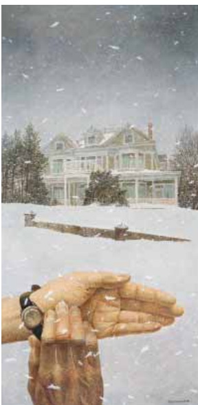
Tom Forrestall (b.1936) Time of the Storm , 2004 egg tempera on gessoed panel 121.5 x 60.5 cm Collection of the Artist

The exhibition, A Brush with War: Military Art from Korea to Afghanistan , presented a glimpse into the Canadian military experience from 1946 to 2008 as interpreted by officially appointed Canadian military artists. Exploring the evolution of military art over the past sixty years, this exhibition looked at works dating from 1947 to 2008 from the two military art programs that started more than twenty years after the Second World War, the Canadian Armed Forces Civilian Artists Program (CAFCAAP, 1968–1995) and the Canadian Forces Artists Program (CFAP, 2001–present). Current works express artists' more personal rather than documentary responses to their subjects; images of peace support operations, the defence of North America, training, military families, and current conflicts, such as the war in Afghanistan, were represented in this exhibition.