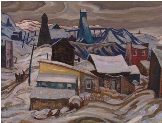
A.Y. Jackson (1882–1974), Ontario Mining Town, Cobalt , 1933, oil on canvas, 53.3 x 71.8 cm, The Irwin Family

Topographies provides a contemporary response and thematic companion to Cobalt: A Mining Town and the Canadian Imagination , which opens concurrently on November 18. The exhibition is curated by Dr Catharine Mastin, who also authored the accompanying in-depth publication. Whereas Banza examines the environmental and social impacts of contemporary mining on the natural landscape, Cobalt: A Mining Town and the Canadian Imagination revisits historic depictions of Cobalt, Ontario, a mining town that served a century ago as a heroic symbol of human industry and Canadian ingenuity, while also being the site of catastrophic environmental devastation.