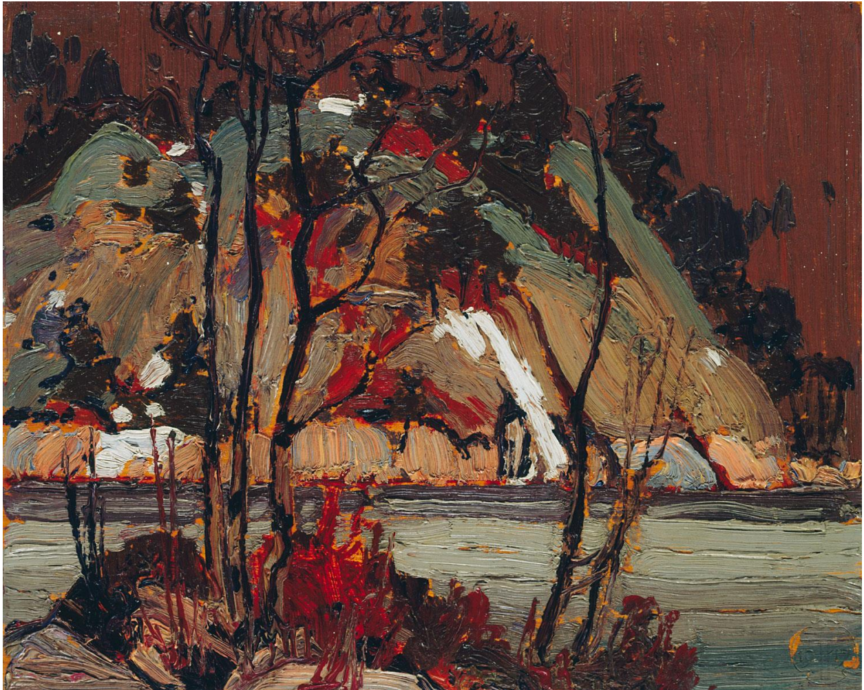
Tom Thomson (1877–1917), Early Spring in Cauchon Lake , 1916, oil on wood panel, 21.2 x 26.7 cm, Anonymous Donor, McMichael Canadian Art Collection, 1972.4