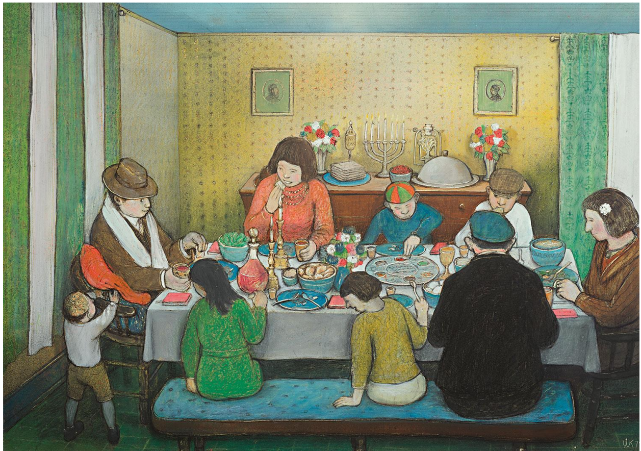
William Kurelek (1927–1977), Jewish Doctor's Family Celebrating Passover in Halifax , 1975.