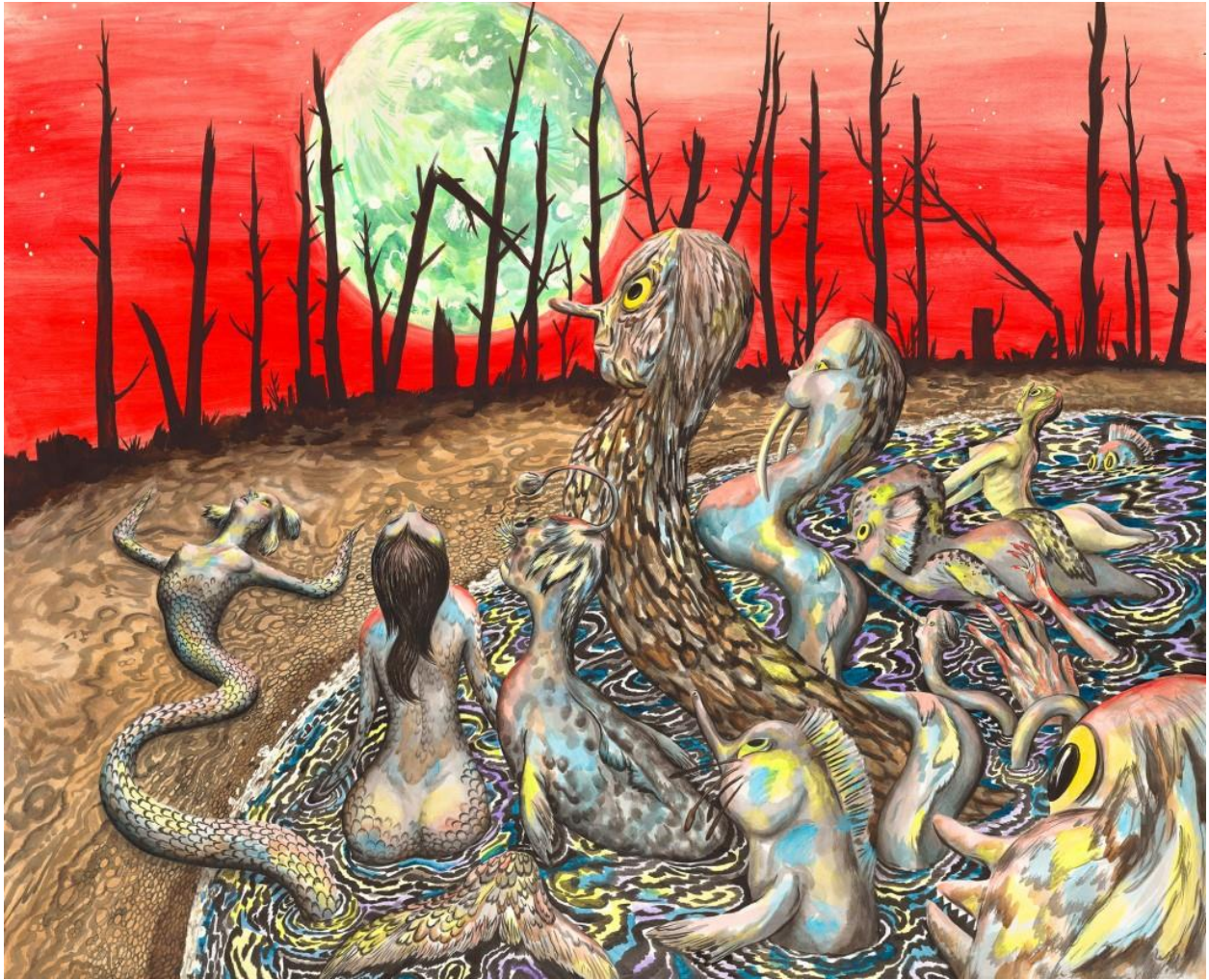
Shary Boyle (b. 1972), Revival Beach , 2011–2015, ink and gouache on paper, 89 x 107 cm, private collection. © Shary Boyle