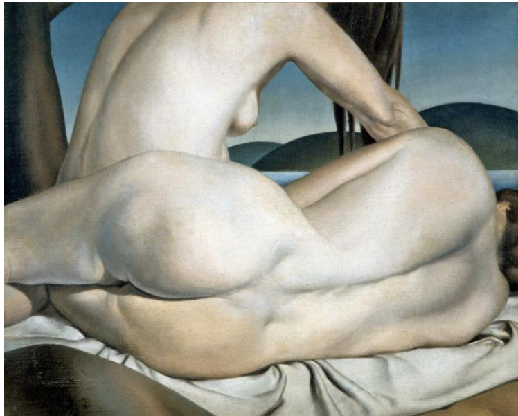
Bertram Brooker, Figures in Landscape , 1931, oil on canvas, 60.9 x 76.2 cm, private collection.

“One of Brooker’s ambitions was to create a visual equivalent to the ineffability of music. His masterpiece, Sounds Assembling , 1928, marries his conception of music and the cosmos,” said Parke-Taylor. “The suggestion of an infinite space beyond the boundaries of the frame evokes the experience of spiritual transport to distant galaxies.”