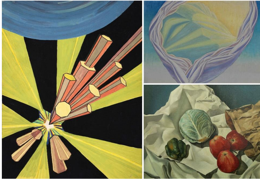
Left: Bertram Brooker (1888–1955), Oozles , 1922, tempera on paper, 22.8 x 17.8 cm, collection of Agnes Etherington Art Centre, purchase, Consolidated Fund, 1976, 19-004. Top Right: Bertram Brooker (1888–1955), Abstraction, Music , (Detail) c. 1927, oil on card, 43 x 61 cm, collection of Museum London, F.B. Housser Memorial Collection, 1945. Bottom Right: Bertram Brooker (1888–1955), Cabbage and Pepper , (Detail) 1937, oil on canvas, 40.6 x 50.8 cm, purchased 1973, Collection of Confederation Centre Art Gallery, Charlottetown, PE, CAG 73.5

The exhibition captures the sweeping breadth of Brooker's output in style and subject matter and will include lyrical abstractions, exacting realistic nudes, Cézanne-inspired still-lives, and bold graphic illustrations. Bertram Brooker: When We Awake! offers a rare vantage point on a pivotal figure in Canada's art and cultural history.