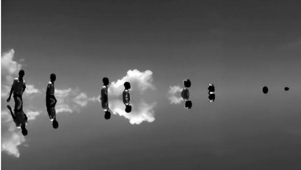
Jeannette Ehlers. Black Bullets , 2012.

Original URL: https://www.theglobeandmail.com/arts/art-and-architecture/article-the-top-10-artworks-of-2021