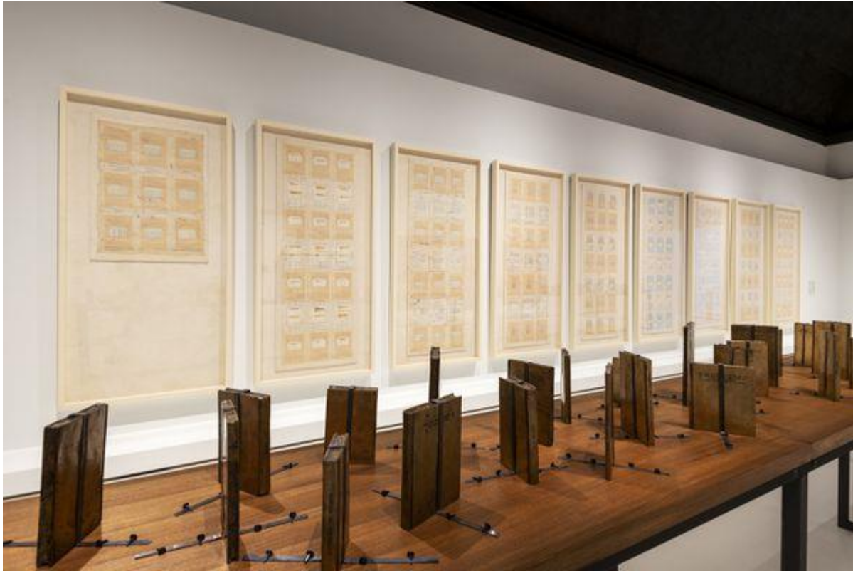
Shilpa Gupta: For, in Your Tongue, I Cannot Fit: 100 Jailed Poets, 2017-2018. MONTREAL MUSEUM OF FINE ARTS

The show's title (taken from a Betty Goodwin sculpture) was awkward but "How long does it take for one voice to reach another?" provided an invigorating look at some recent acquisitions from the Montreal Museum of Fine Arts' collection. One long gallery was divided down by the middle by a narrow table to which the Indian artist Shilpa Gupta had bolted 100 little metal sculptures of closed books. Each represented a poet jailed for writing – from different eras and 40 different countries including Nigeria, Pakistan, France and the United States. The museum acquired this powerfully physical retort to censorship in 2019.