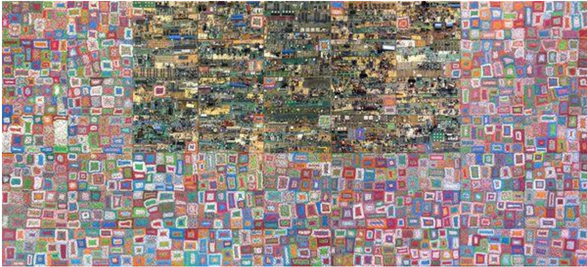
Elias Sime: Tightrope: In Boxes (reclaimed electronic components and insulated wire on panel), 2017.

The Ethiopian artist Elias Sime accumulates discarded computer parts to create majestic abstracts that read as aerial views of landscapes and cities, creating tension between natural environments and electronic detritus. Tightrope: In Boxes was one of the highlights of his engrossing exhibition at the Royal Ontario Museum: brown and green motherboards might be a town; colourful squares of coiled wire suggested the fields beyond, the image evoking both our love of technology and a deceptively tame version of nature.